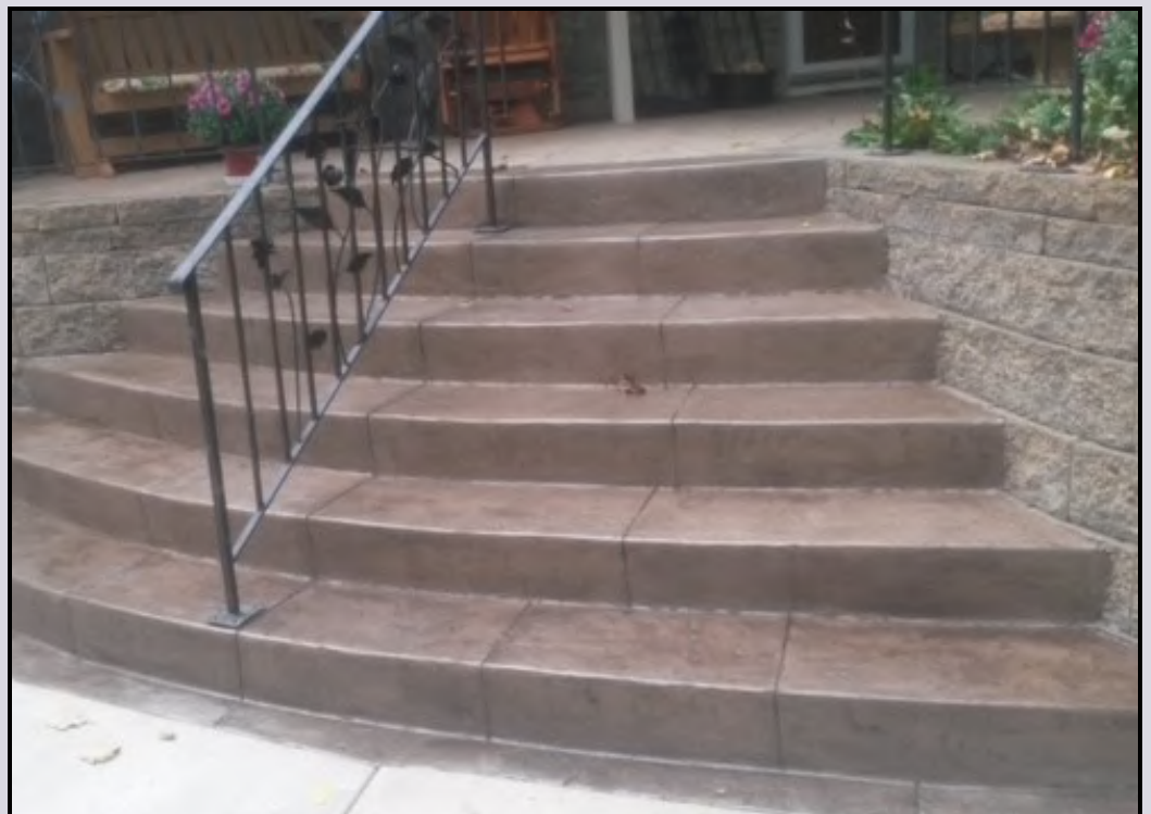
Slate Textured Steps Rosemary Color Medium Brown Tint