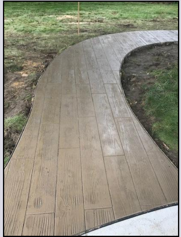
8" Wood Plank Pattern Leather Color Light Brown Tint