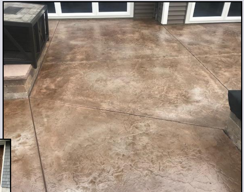
Jumbo Slate Texture Pattern

Rosemary Color Light Gray Highlights Medium Brown Tint