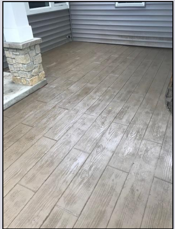
8" Plank Pattern Leather Color Light Brown Tint