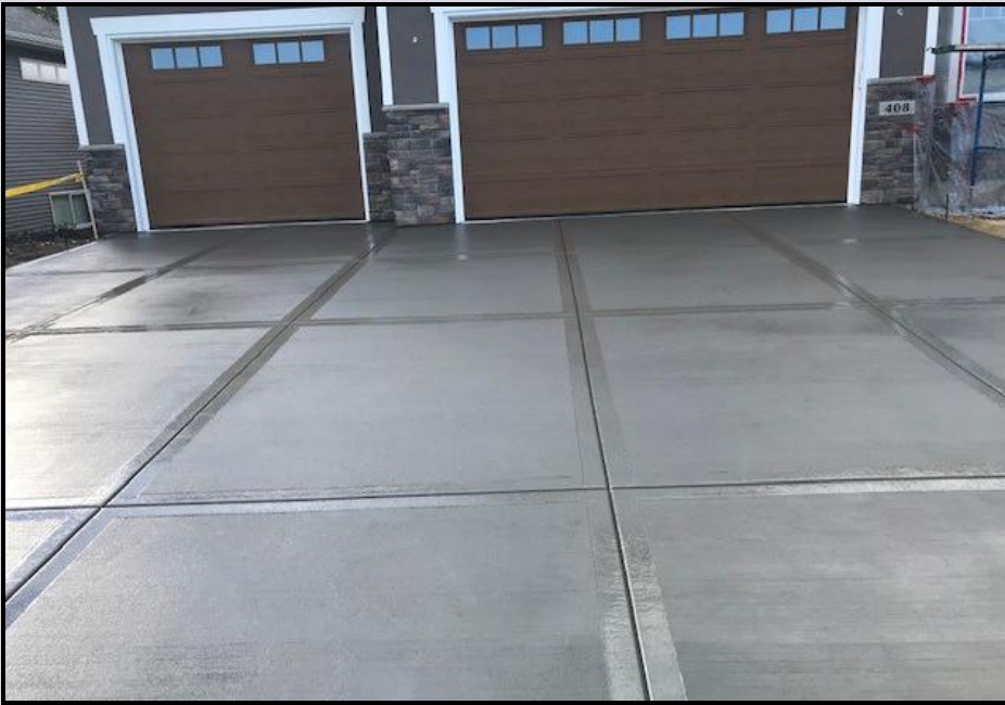
Regular Gray Broom "Picture Frame" Hand Tooled Joints