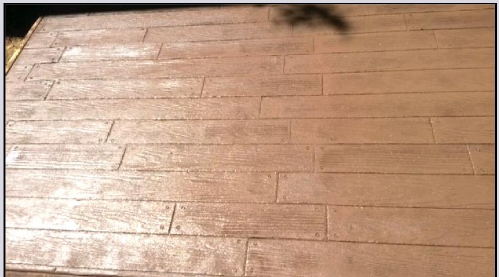
6" Wood Plank Pattern Leather Color Medium Brown Tint