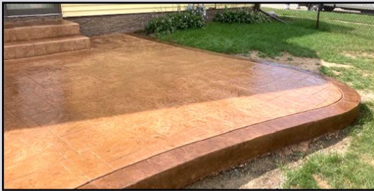
Ashlar Slate 12" Slate Border Desert Tan Color Light Brown Tint