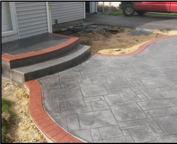
Ashlar Slate Slate Color Charcoal Tint 8" Brick Red Border