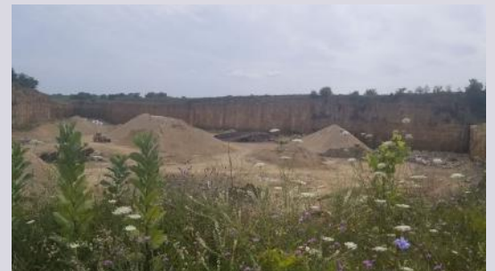
Fink's Limestone Quarry

Now Celebrating over 50 years in business!