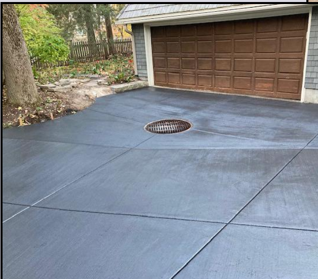
Broom Finish Hand Tooled Joints

Rosemary Color Light Gray Highlights Medium Brown Tint