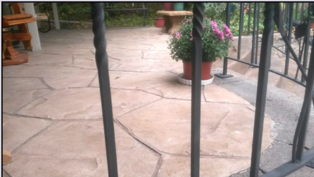
Arizona Flagstone Pattern