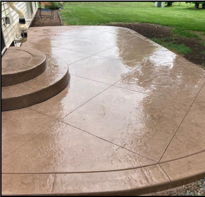
Jumbo Slate Texture Earthen 4'x4' Sawcut Squares Color 8" Slate Border No Tint