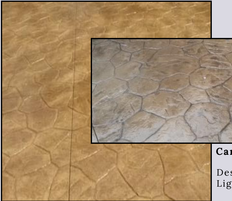
Canyon Stone Pattern