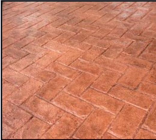
Herringbone Brick Pattern