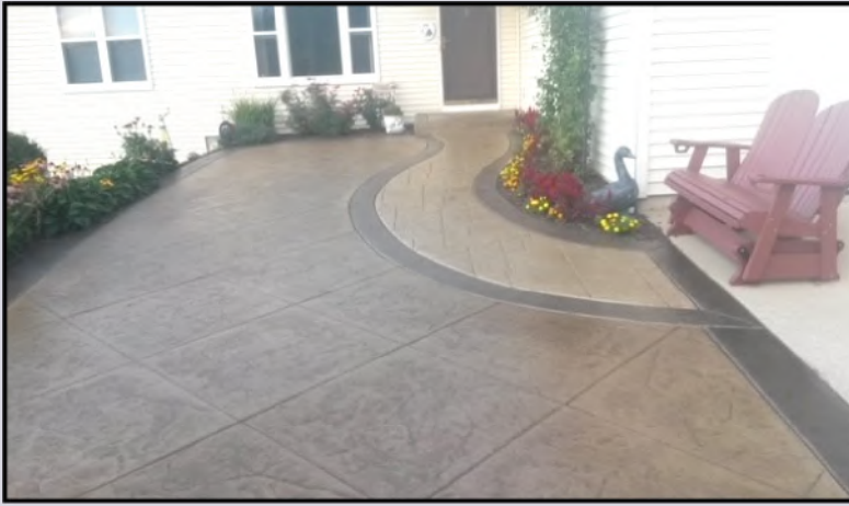
3'x3' Textured Slate Pattern Rosemary Color Medium Brown Tint Dark Brown Border