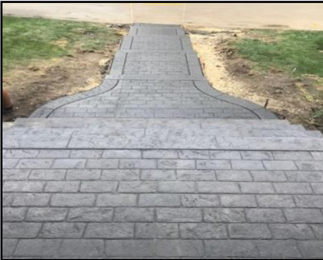
Cobblestone Pattern Smoke Color Charcoal Tint 8" Slate Border